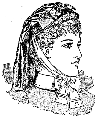
The "St. Bride's" Bonnet. Made of fine Straw with Lace and ruching, and trimmed with Ribbon, and long Silk Gossamer Fall. In black and colours, 12/6 each. Without Fall, 9/6; also