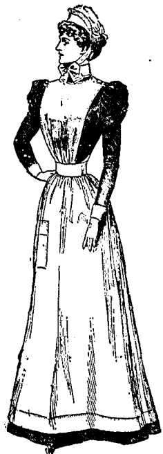
The "Rena" Apron. Made of linen finished Cloth lock-stitch throughout, 2/6 each. In two sizes, 36 in. & 39 in. from waist to hem.